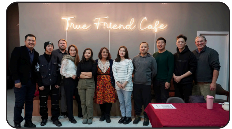
Meeting with Teen Missions Mongolia alumni

base coordinator how to run a Boot Camp. Lord willing, in the near future, I will be going over to help run a Boot Camp in Mongolia in the coming years. The trip was such an awesome time of learning, growing, and developing as a young person in ministry. In Honduras we have around 35-40 young teens serving the Lord for five to six weeks. Please be praying for the team members, leaders, and Teen Missions staff as they continue in what God has called them to do.