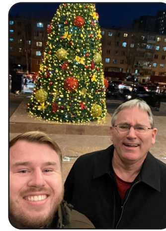
Dad and I in Mongolia

Mongolia, with my dad for a setup trip for a TMI summer team. We went from the 70s of sunny Florida to the -7 of Mongolia. Dad and I spent around five days in Ulaanbaatar meeting with pastors, ministry leaders, and former team members when TMI was in Mongolia in past years. The meetings were very fruitful and such a blessing as we heard countless moments of how God was working through youth in Mongolia. The goals for Mongolia are being surrounded by prayer continually and will continue to be as long as God has that door open. We are very excited to see what God will do.