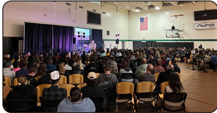
Main session at Ignite conference in Oregon

First off, to you who are reading, I want to say thank you for your encouragement and support of what I do in serving the Lord. I count myself truly blessed to be able to serve God in ministry and have amazing people backing me in prayer and support. It has been such a busy last couple of months. The Lord continues to work in mighty ways and these last couple of months have been so special. One of the biggest blessings in this life is to be a part of what God is doing. He is the one that allows us to be part of and experience all that is going on. It is such a privilege to share with you all He is doing and how you are impacting eternity with your prayers and support.