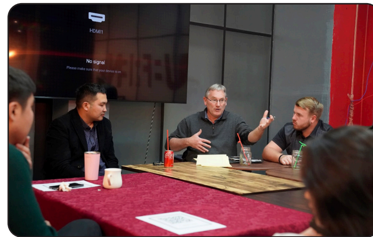
Dad and I presenting a plan for ministry in Mongolia

Most recently, on December 26th, I flew to San Pedro Sula, Honduras, to attend Teen Missions' Honduras Boot Camp. My assignment and goal for the trip was to learn from our Honduras