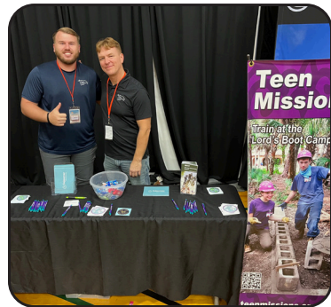
TMI promotions opportunity in Oregon

Since my last update back in August, I have been traveling a good amount for promotions along with setup assignments for upcoming Teen Missions Intl (TMI) teams for the summer. In October I started out by doing some promotions for TMI in the beautiful Rocky Mountains of Colorado. My girlfriend's parents were gracious enough to host me for a couple of days in Colorado Springs before I moved over to Arvada where I stayed with one of the pastors from one of my sending churches at Redeemer Temple. The host homes were such a joy as I could rest in between gigs, but also have such uplifting fellowship during the off times with fellow believers.